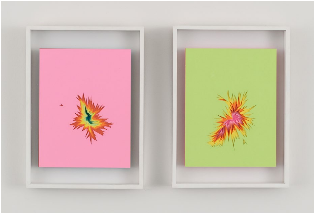
Cristina Ochoa (1976) Explosiones titánicas 1, 2016 Perforated cotton paper Dyptych Framed Dimensions: 14.96 x 10.94 x 1.34 " 38 x 27.8 x 3.4 cm. each Edition Unique