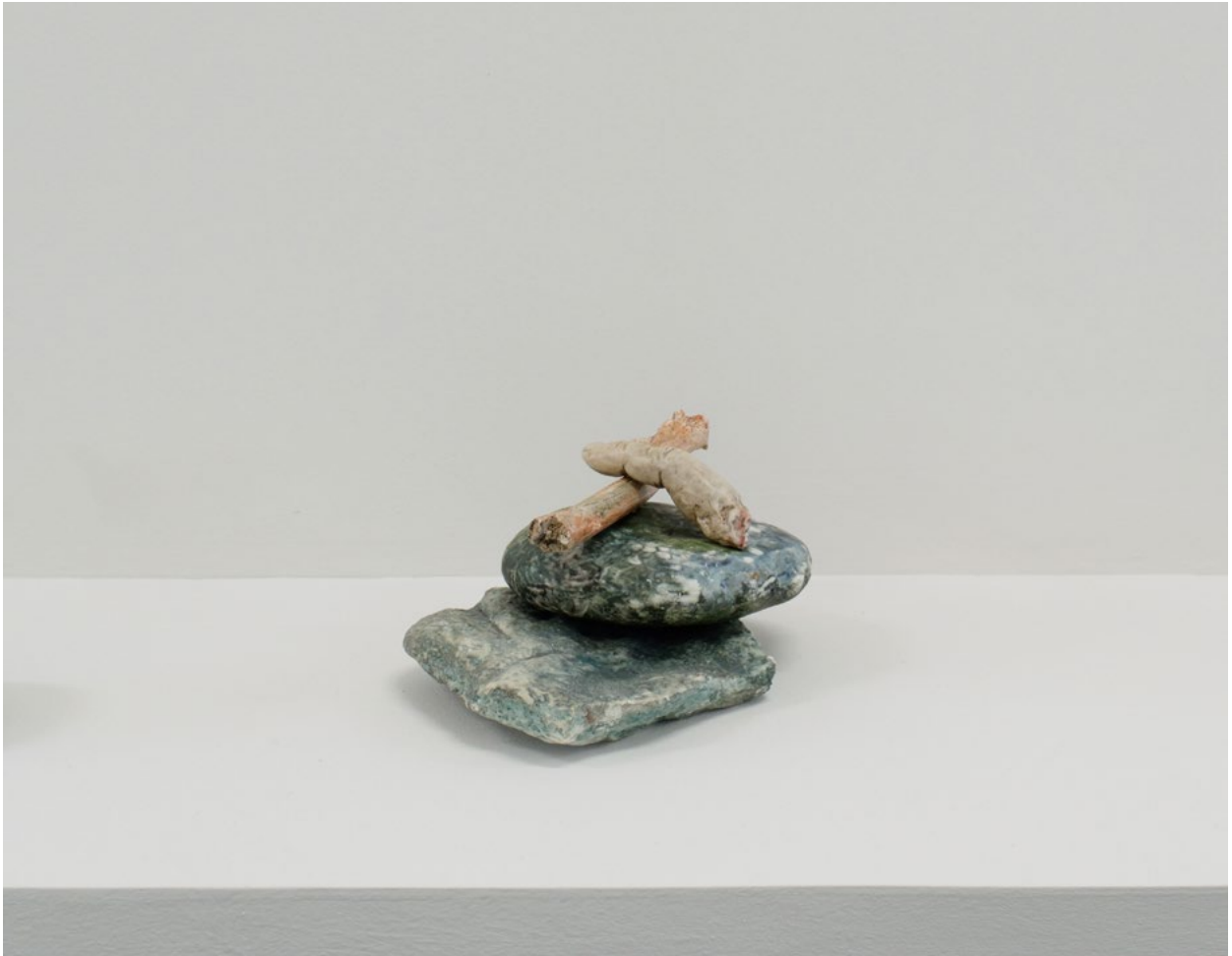
Natalia Castañeda (1982) Piedras Errantes , 2014 Porcelain Image Dimensions: Variable