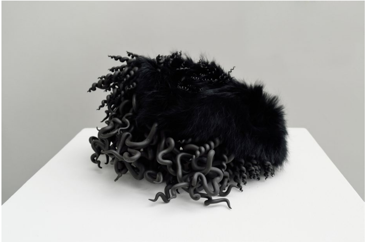
Gabriel Antolinez (1980) Pelo Negro, 2013 Rabbit fur, cold porcelain, wire Dimensions: 7.87 x 11.81 x 7.87 " 20 x 30 x 20 cm. Edition unique