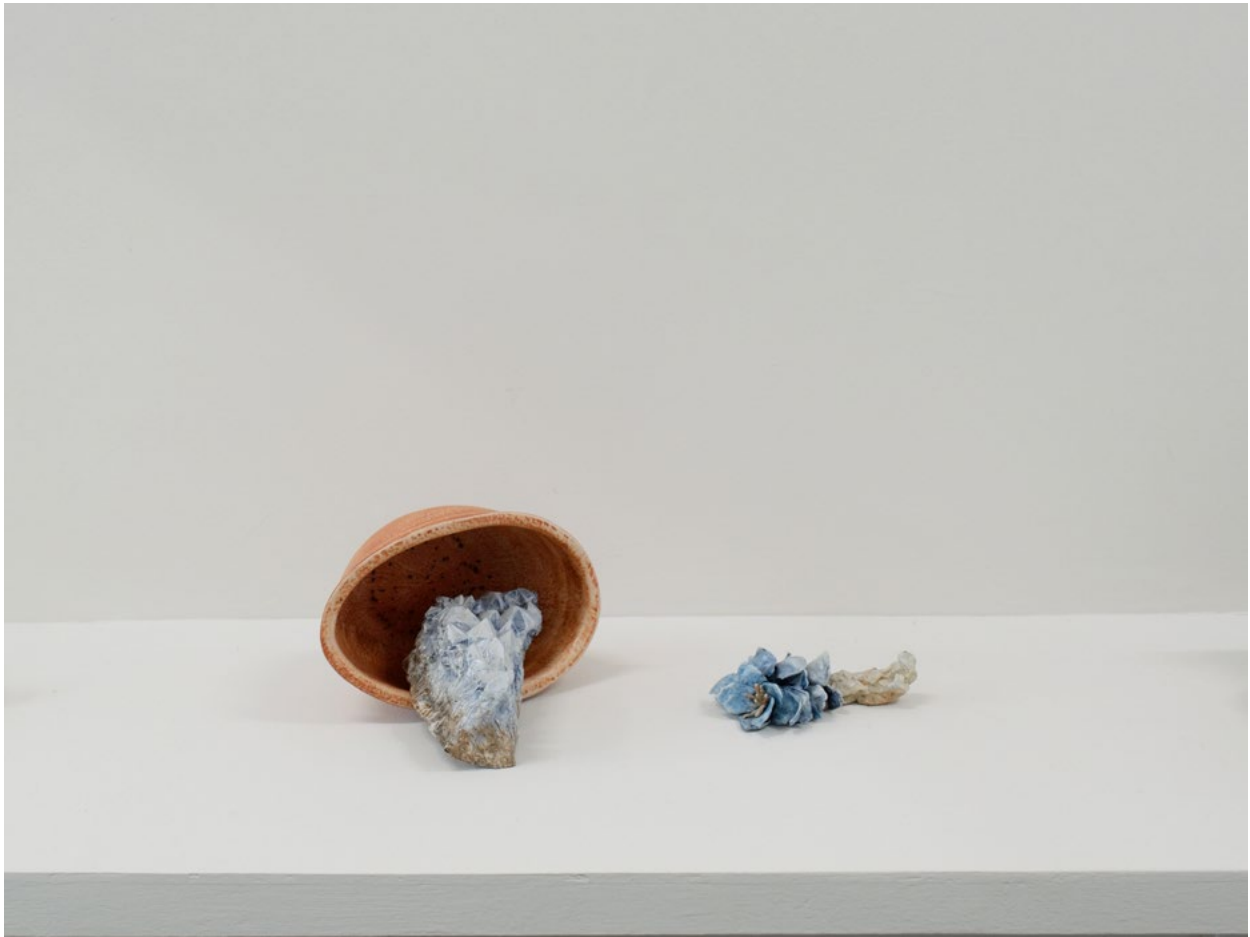
Natalia Castañeda (1982) Piedras Errantes , 2014 Porcelain Image Dimensions: Variable