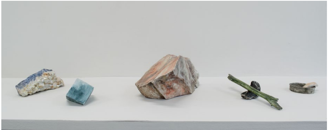
Natalia Castañeda (1982) Piedras Errantes , 2014 Porcelain Dimensions: Variable