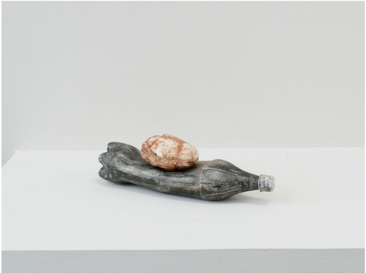
Natalia Castañeda (1982) Piedras Errantes , 2014 Porcelain Image Dimensions: Variable