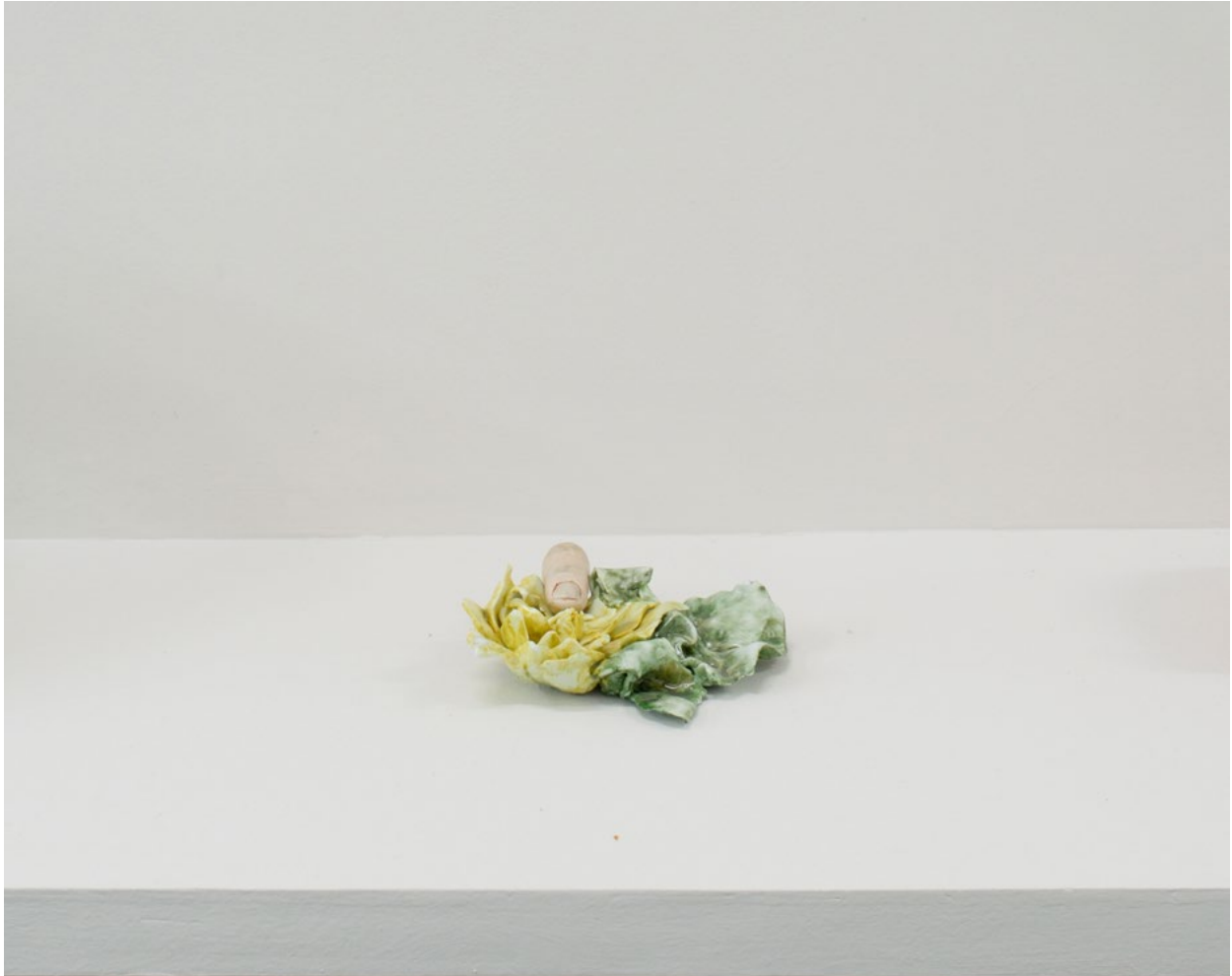
Natalia Castañeda (1982) Piedras Errantes , 2014 Porcelain Image Dimensions: Variable