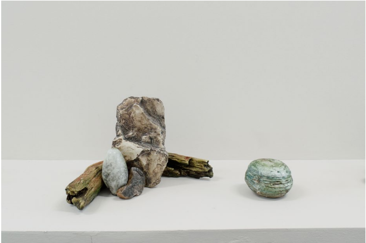
Natalia Castañeda (1982) Piedras Errantes , 2014 Porcelain Image Dimensions: Variable