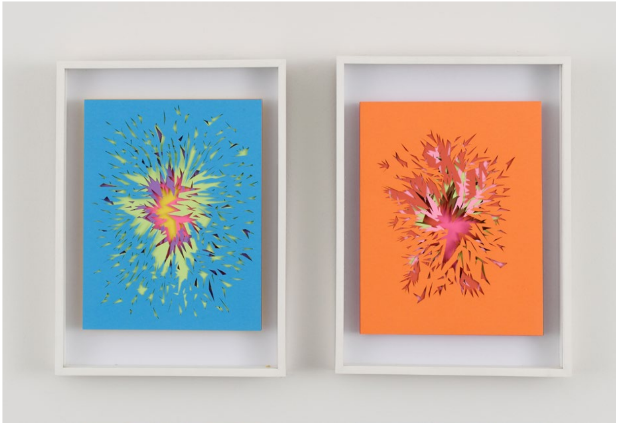
Cristina Ochoa (1976) Explosiones titánicas 2, 2016 Perforated cotton paper Dyptych Framed Dimensions: 14.96 x 10.94 x 1.34 " 38 x 27.8 x 3.4 cm. each Edition Unique