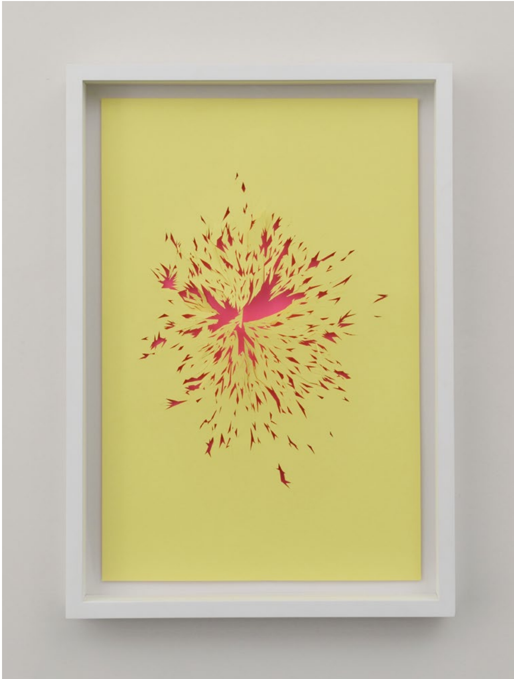
Cristina Ochoa (1976) Supernova (amarillo), 2016 Perforated cotton paper Framed Dimensions: 23.62 x 35.43 " 100 x 70 x 7 cm. Edition unique