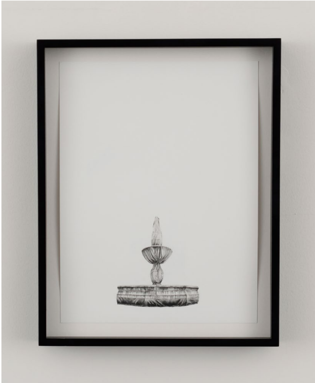
Lía García (1982) De la serie Objeto de dibujo, 2012 Pencil on paper Image Dimensions: 12.2 x 16.14 " 31 x 41 cm. Edition unique