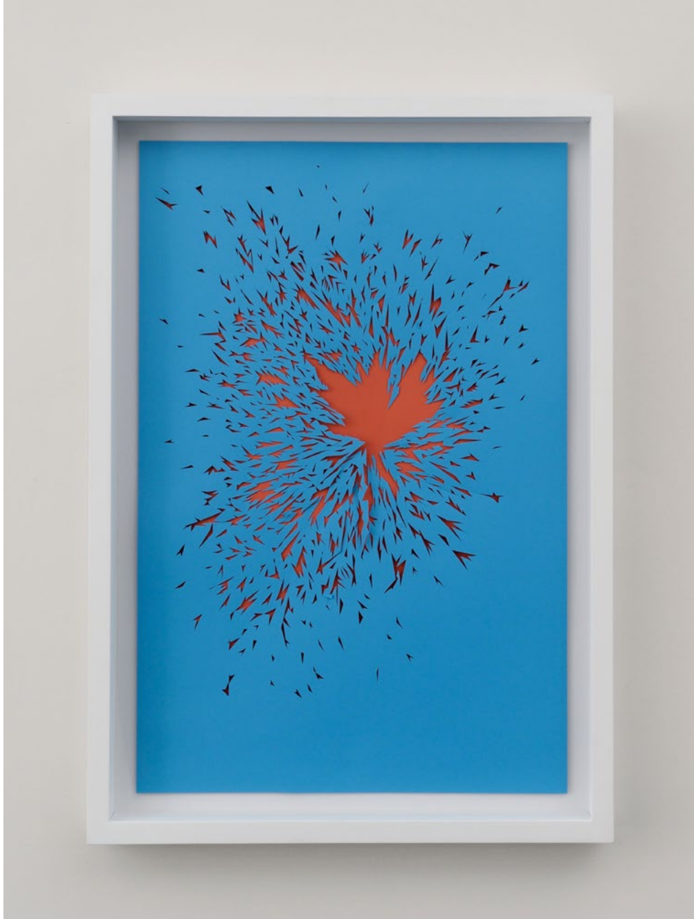
Cristina Ochoa (1976) Supernova (azul), 2016 Perforated cotton paper Framed Dimensions: 39.37 x 27.56 x 2.76 " 100 x 70 x 7 cm. Edition unique