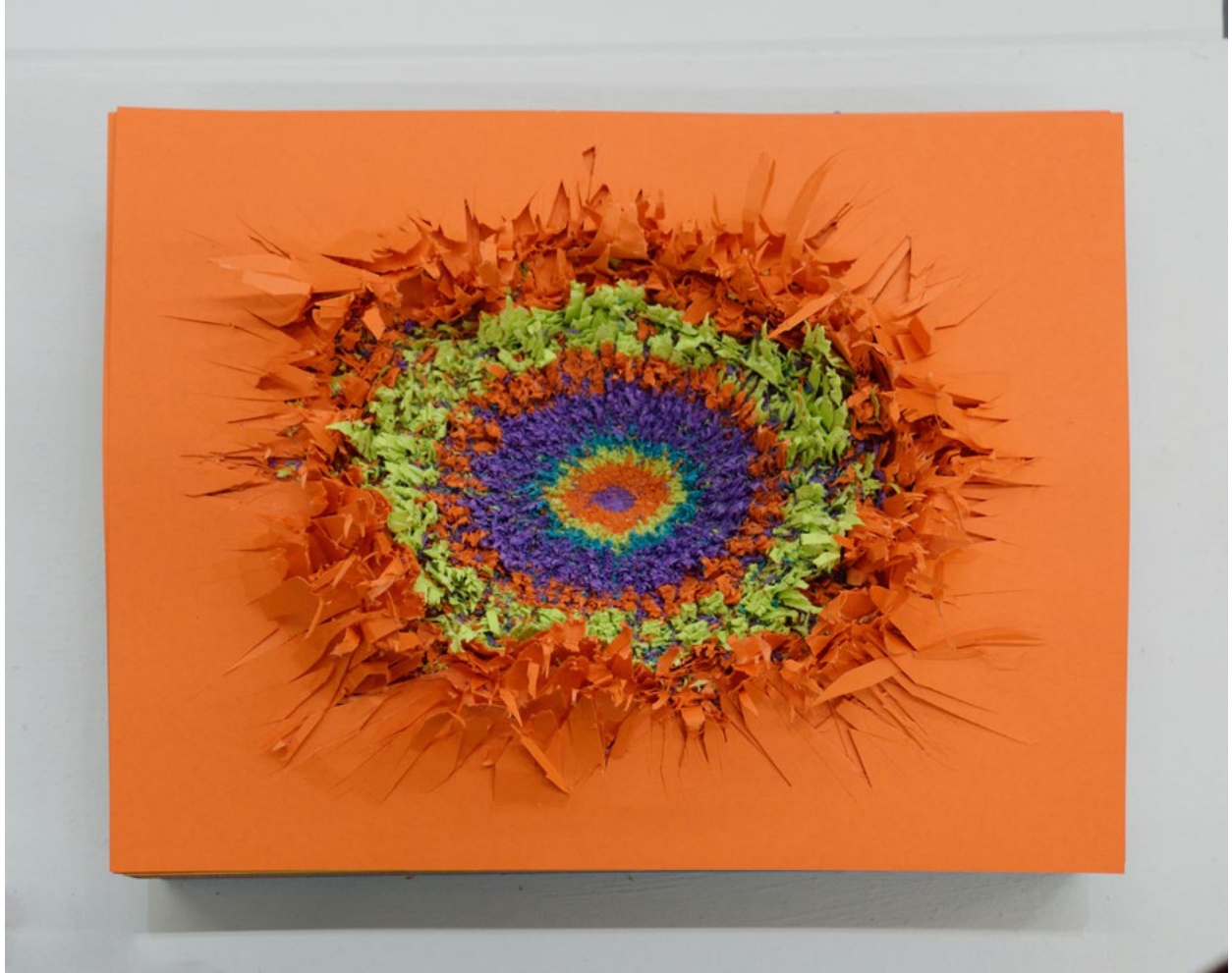
Cristina Ochoa (1976) Sculpture, 2016 Perforated cotton paper, acrylic box Dimensions: 15.75 x 11.81 x 15.75 " 40 x 30 x 40 cm. Edition Unique