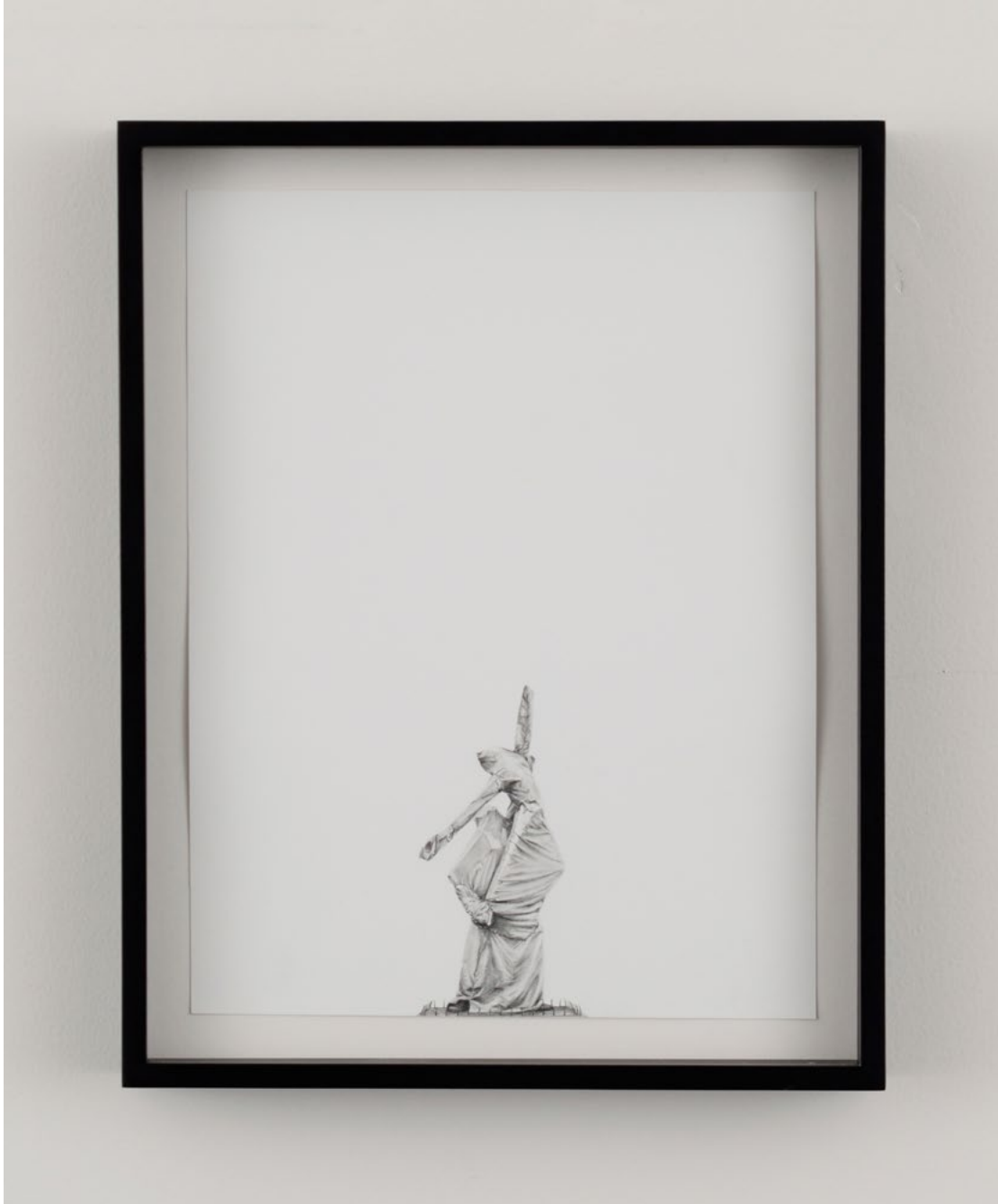
Lía García (1982) De la serie Objeto de dibujo, 2012 Pencil on paper Image Dimensions: 16.54 x 23.23 " 31 x 41 cm. Edition unique