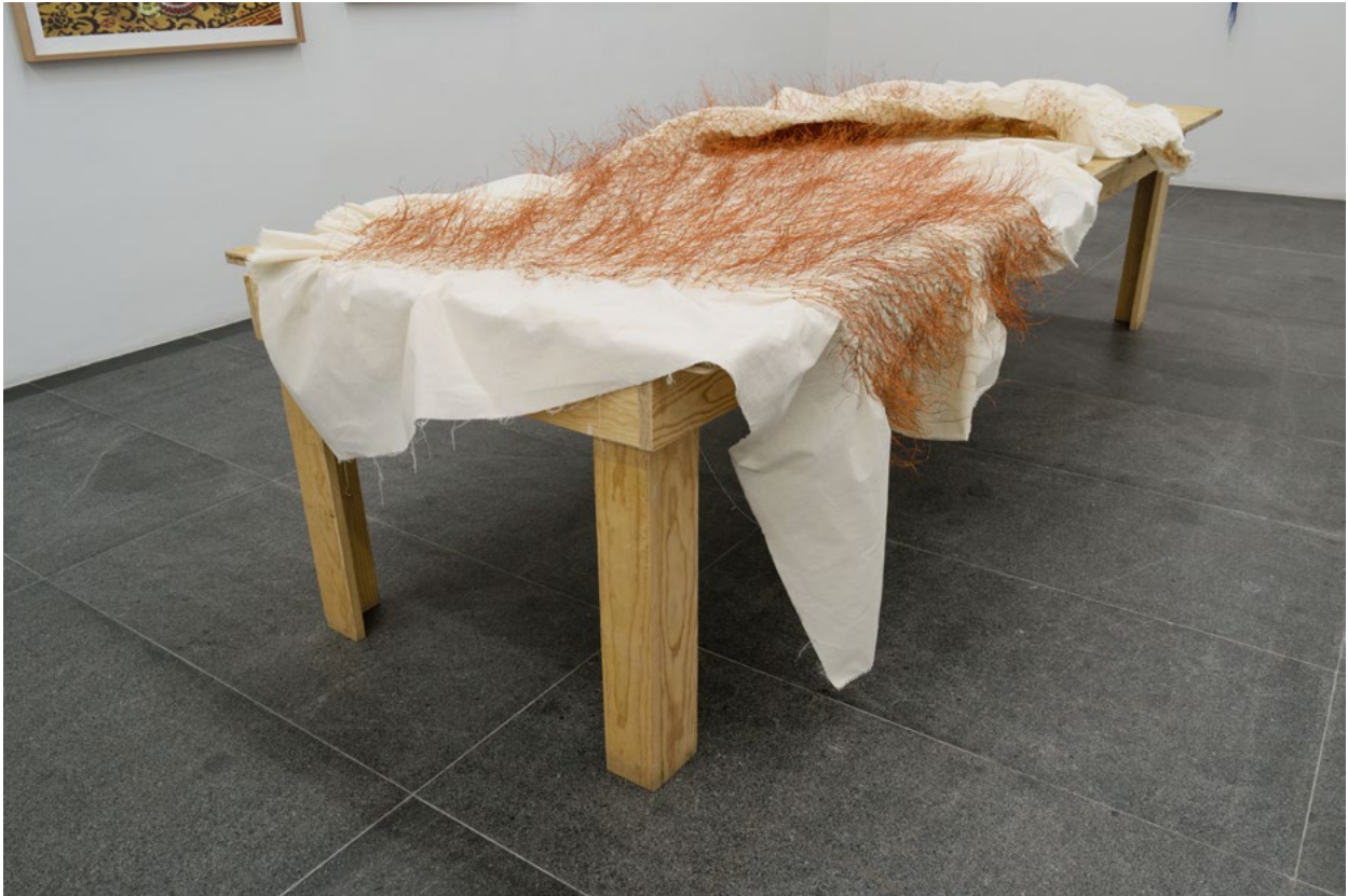
Ana Belén Cantoni (1983) Movimientos desbordados II, 2014 Fabric and copper wire Dimensions: 62.99 x 236.22 " 160 x 600 cm. Edition unique