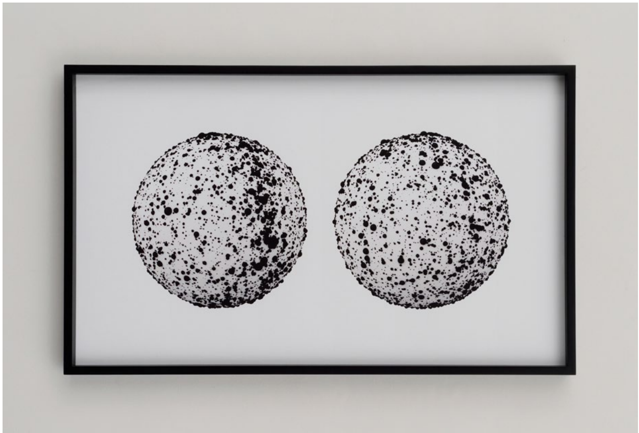
David Peña Lopera (1981) Esfera Celeste Invertida, 2010 Inject print 42.91 x 25.59 " 109 x 65 cm. Edition 1 of 5