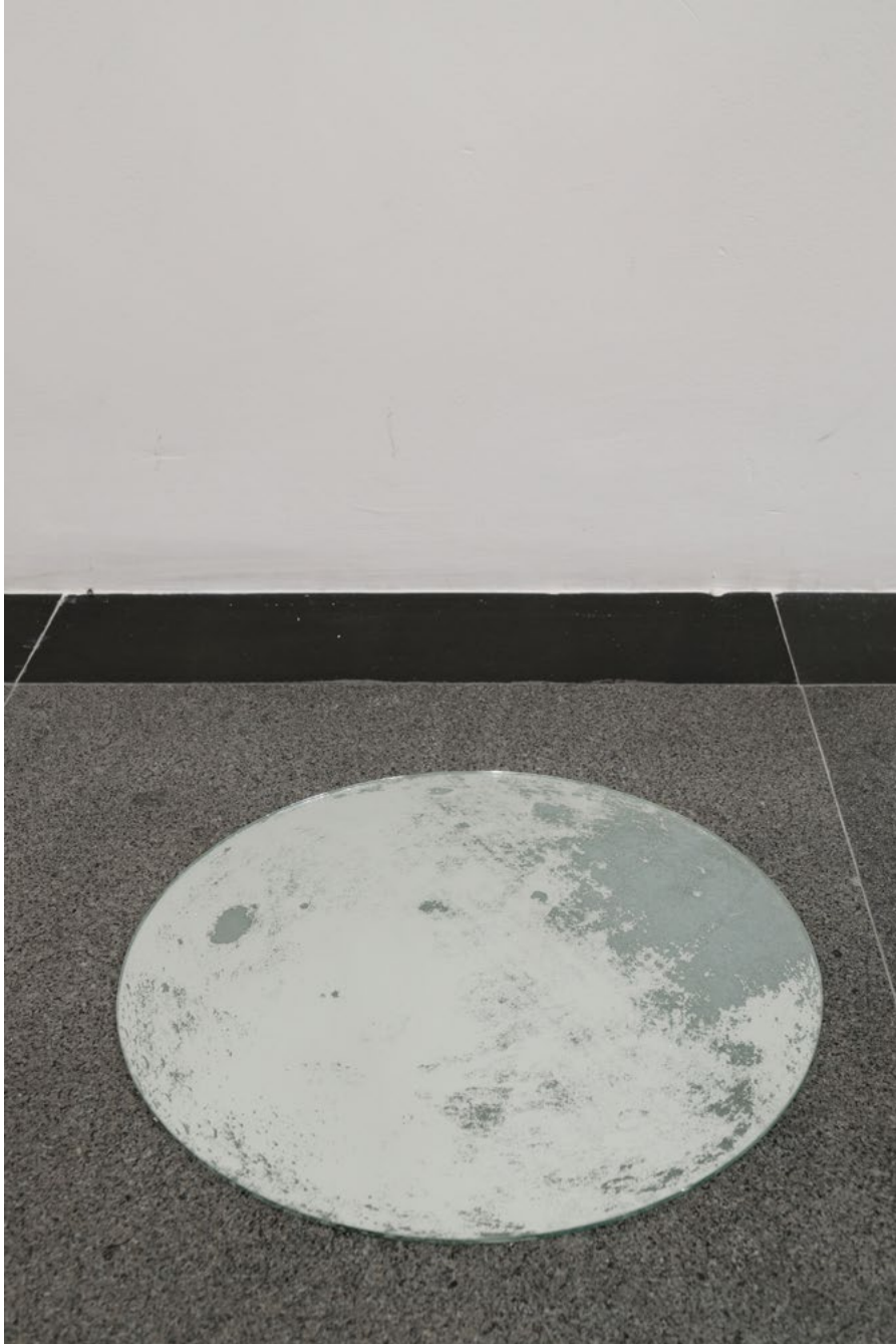
David Peña Lopera (1981) Lado Ocullo de la Luna, 2014 Laser engraved mirror Diameter: 15.75 " 40 cm. Edition 1 of 10