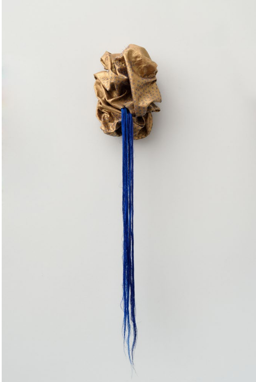
Gabriel Antolinez (1980) Celeste, 2013 Leather, thread, aluminum support Dimensions: 31.5 x 9.84 x 5.91 " 80 x 25 x 15 cm. Edition unique