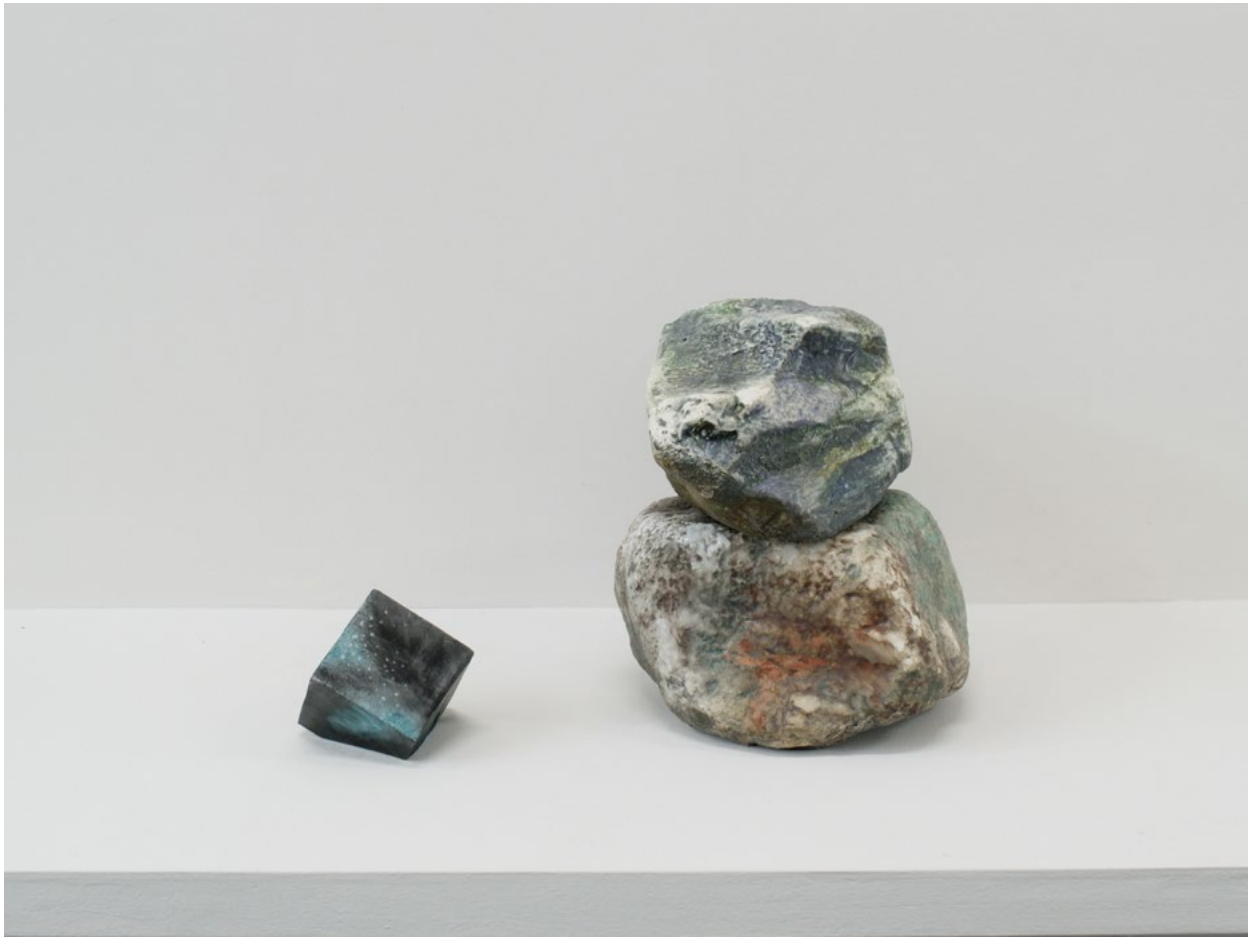
Natalia Castañeda (1982) Piedras Errantes , 2014 Porcelain Image Dimensions: Variable