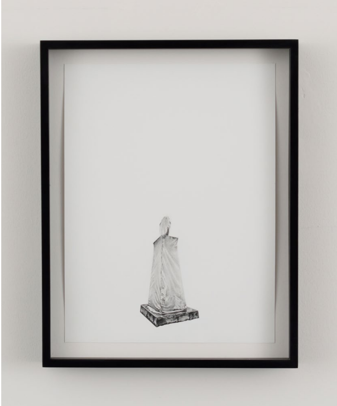
Lía García (1982) De la serie Objeto de dibujo, 2012 Pencil on paper Image Dimensions: 12.2 x 16.14 " 31 x 41 cm. Edition unique